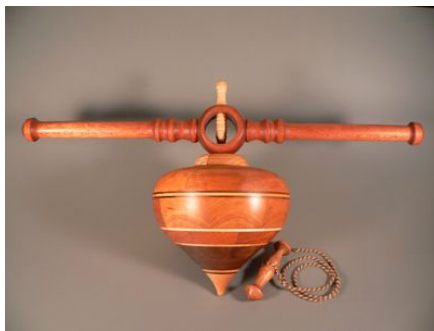
Bob Fain - Over the Top