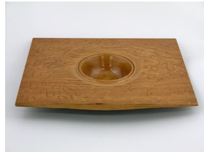
Jeanette Baker - cherry platter