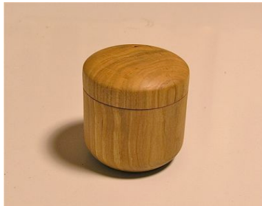
Lin Kwis - box