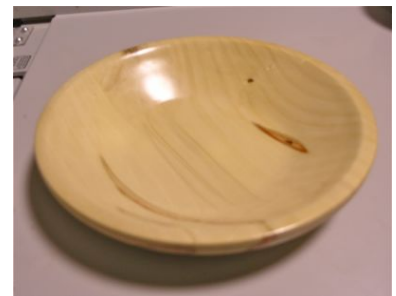
Steve Van bowls - oak, ambrosia maple, box elder