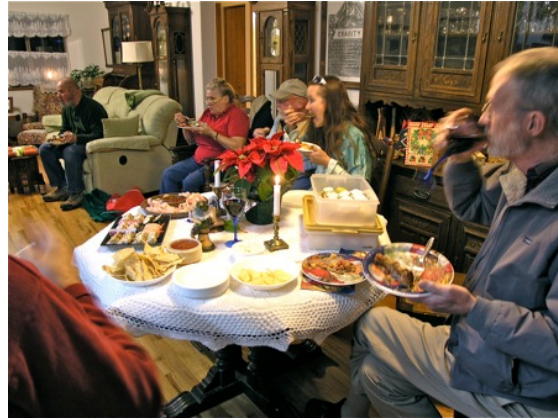
The food was diverse and delicious and enjoyed by all.