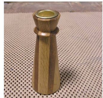
Steve Van - candle holder