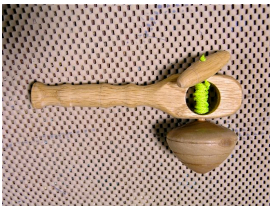
Mike Dries - spinning top