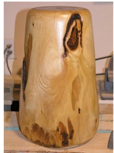
Steve Van - acacia lamp base