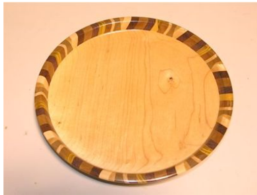
Lin Kwis - segmented platter