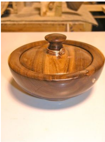
Lin Kwis - acacia covered bowl