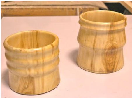
Karl Doerry - wine bottle holders