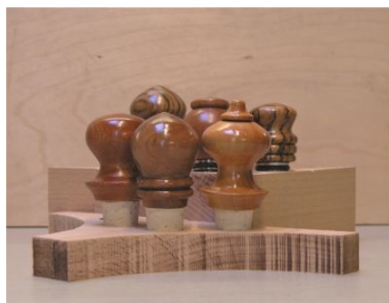
Jeanette Baker - bottle stoppers