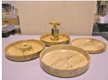
Lin Kwis - nut cracker and bowls