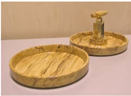
Steve Van - spalted maple nut cracker, bowl, and bottle