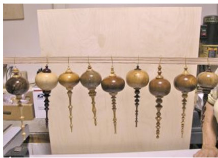
Lin Kwis - globe ornaments