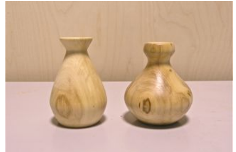
Andy Fox - weed pots