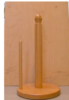
J Baker - paper towel holder